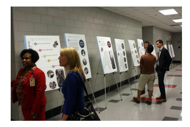
The Adamsville Recreation Center was the site of one of several presentations on options for inclusion on a transit referendum project list.

decide on your own "wish list. You can find it at martamenu.com. ( More on next page )