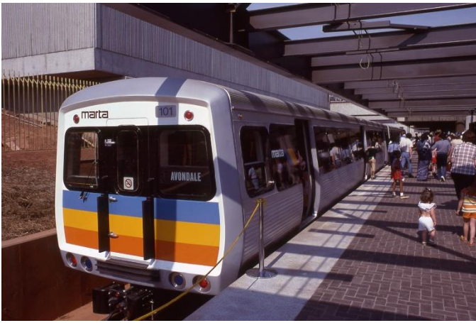
These railcars were state of the art when MARTA service began in 1979. Now MARTA is making plans to replace them.