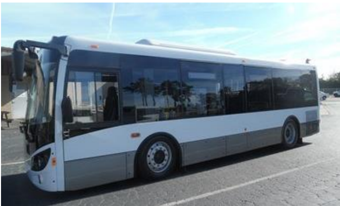
Smaller, more maneuverable buses provide service on Marta's Community Circulator network.