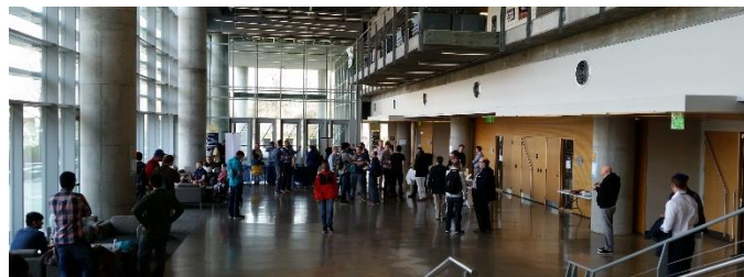
About 100 people attended Transit Camp South last year.

Transportation Camp is returning to Atlanta. Transportation Camp South 2018 will run from 9 am to 5 pm Feb. 24 at Georgia Tech. Co-sponsored by CfPT, the annual event brings planners, scholars and activists together for a day of learning, debating, connecting and creating. While the day kicks off with scheduled presentations, later sessions are proposed and conducted by conference participants. Registration is $25 ($15 for students), and it includes a light breakfast, a box lunch and a T-shirt. You can learn more at TransportationCamp South on Facebook.