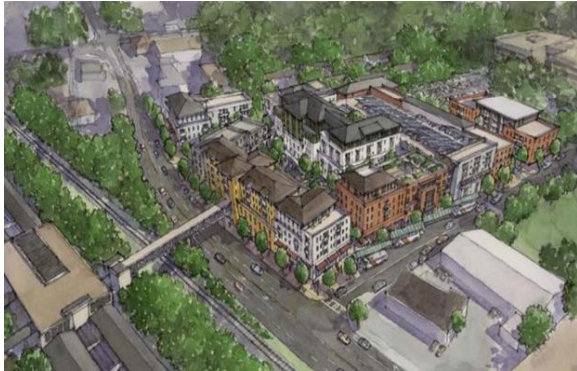
Architect's rendering of the transit-oriented development next to Avondale station. It will be connected by a pedestrian overpass to the station, shown in the lower left-hand corner of the picture.