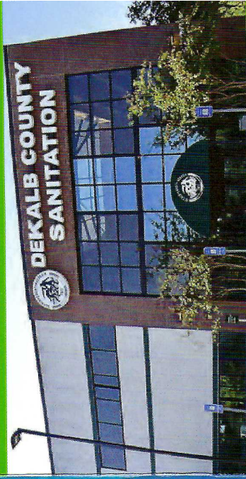
Sanitation Division Administration Building