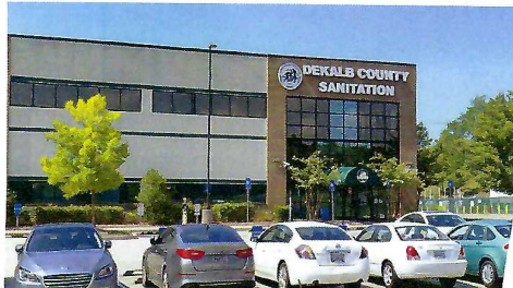
Sanitation Division Administrative Office