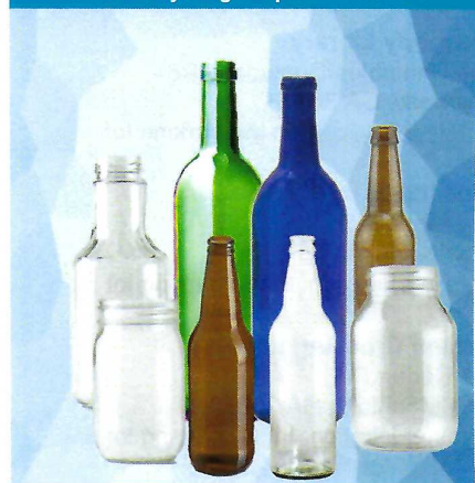
Acceptable Glass Colors