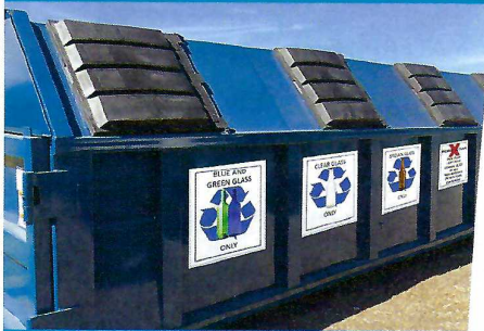
Glass Recycling Drop-off Container