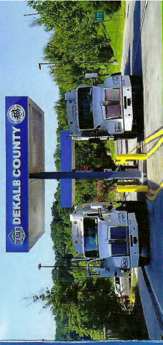
Sanitation Division Public CNG Fueling Station