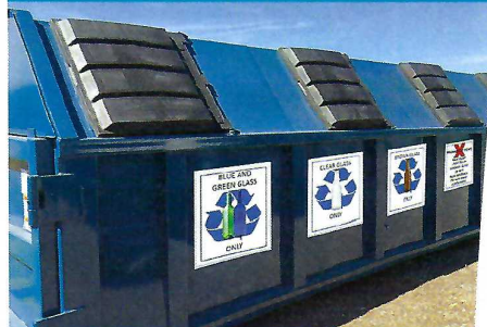
Glass Recycling Drop-off Container