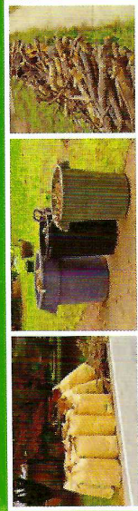
(properly prepared yard trimmings)