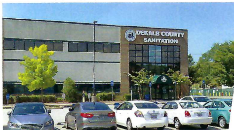
Sanitation Division Administrative Office