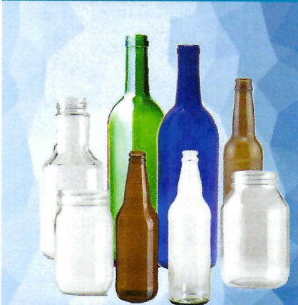
Acceptable Glass Colors