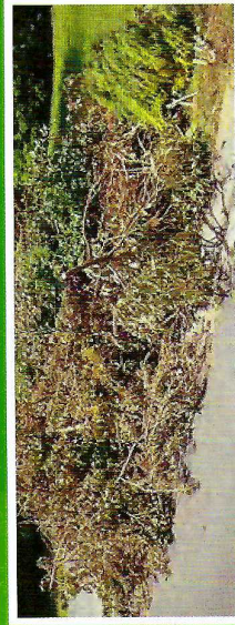
(improperly prepared yard trimmings)