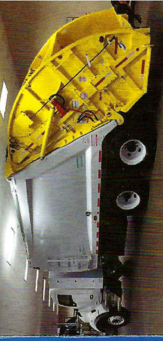
Sanitation Division Residential Rear-loader Truck